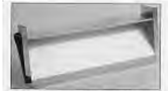
Barometric Fresh Air Damper

Wall-Mounts are designed to provide optional ventilation packages to meet all of your ventilation and indoor air quality requirements. All units are equipped with a barometric fresh air damper as the standard ventilation package. All optional ventilation packages are field-installed only.